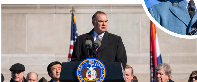
Missouri State Highway Patrol provides security at the gubernatorial inauguration of Mike Kehoe.