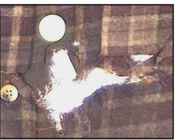
When a firearm is discharged at a close distance to (or in contact with) a victim, there may be physical characteristics present on the victim's garment, such as melting of the entrance hole's immediate perimeter, obvious soot/vaporous cloud on the outer perimeter, and/or very irregular hole.